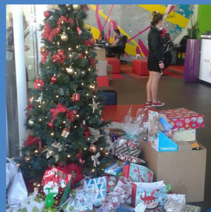
Christmas gifts from Les Mills

Aviva was gifted 4,041.3 hours of time – equivalent to almost two years' of 40-hour work weeks – in the last financial year from our SASSC volunteers, student placements, gifted staff and Board members time, and casual volunteers.